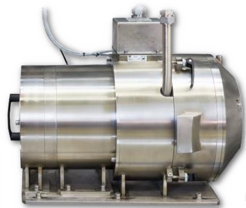
CID-03 Continuous Iodine Detector