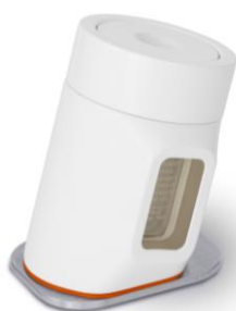
PT643R0 Slanted stand for elution vial