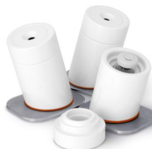
PT500R2 Slanted stand for activity distribution